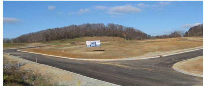
Infrastructure improvements in Gateway Commerce Park

Infrastructure improvements were completed in the Bristol Business Park off TN Hwy. 394. The park’s first occupant, Media General’s Bristol Herald Production facility began operations in April.