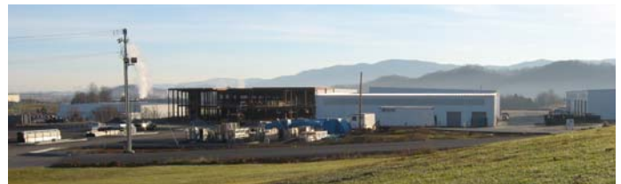
Edwards' new facility nears completion

allow for an increase in employment of 80 to 90.