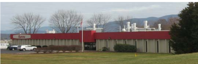
Aurora Hardwoods moves into new plant in Piney Flats

In April, Royal Moldings broke ground on a 250,000 sq. ft. expansion of its Bristol plant. The expansion, which is nearing completion, will