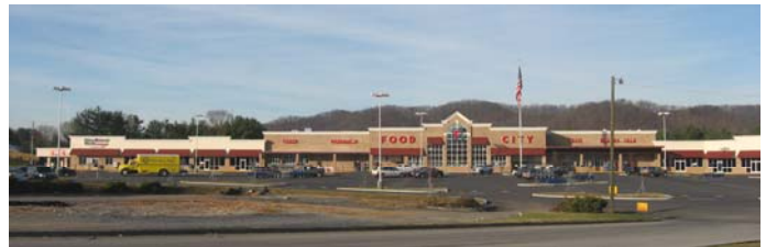
New Food City Shopping Center in Bristol

At Northeast State Technical Community College, where enrollment exceeded 5,000 in 2006, there are four buildings currently under construction. A $14.7 million humanities building along with a 500-seat performing arts center are being built. Smaller structures under construction include a public safety office and a government services building.