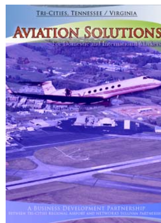
9" x 12" folder with inside pocket

The two organizations will exhibit at the Heli-Expo (Helicopter Association) in March 2007.