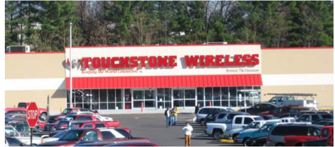
Touchstone Wireless housed in newly renovated facility

Apple International , a helicopter sales company, will locate in the Bristol Industrial Park.