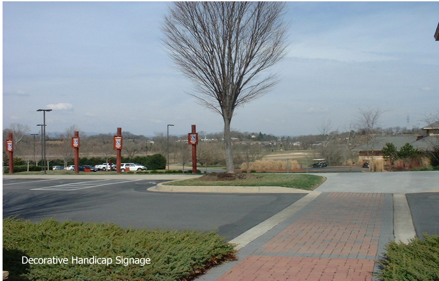
Decorative Handicap Signage