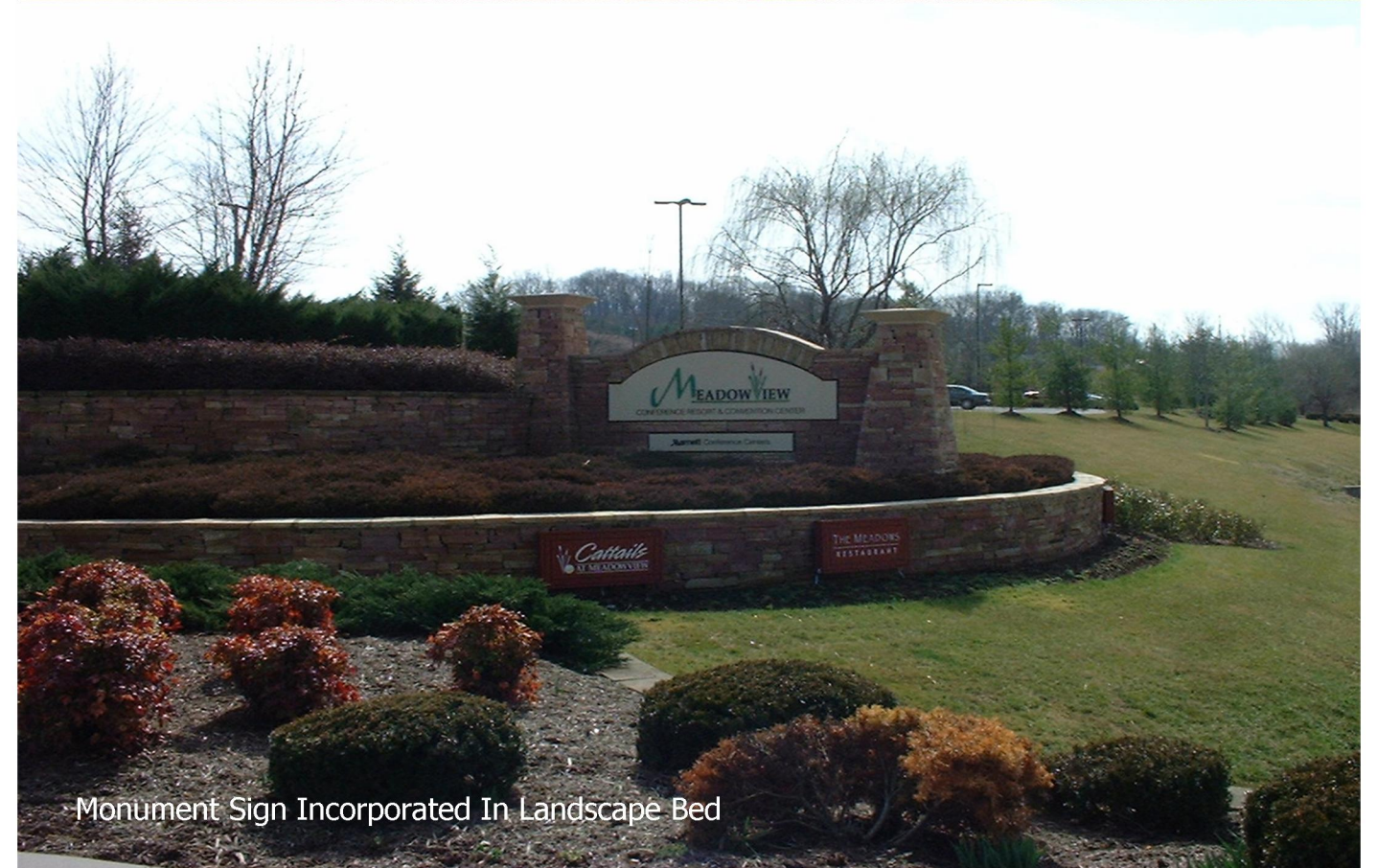
Decorative Lights, Landscaping, Monument Sign