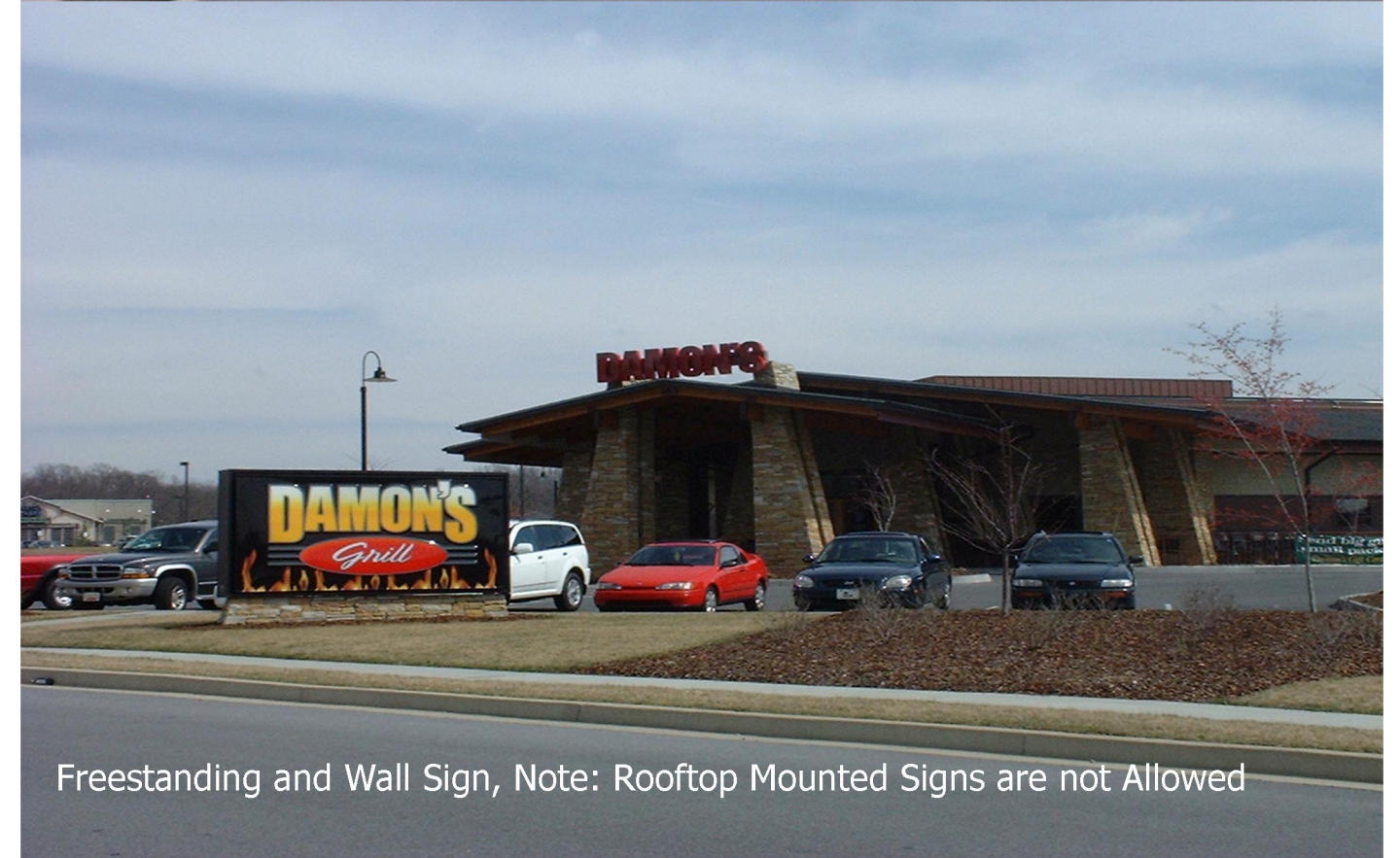
Freestanding and Wall Sign, Note: Rooftop Mounted Signs are not Allowed