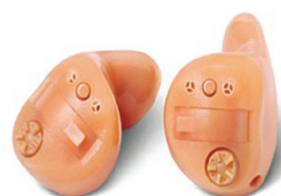
In the ear