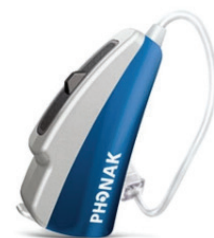
Behind the ear