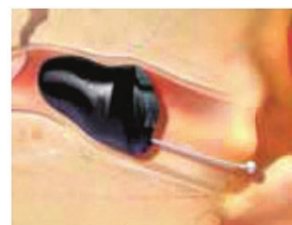
Hidden in the canal