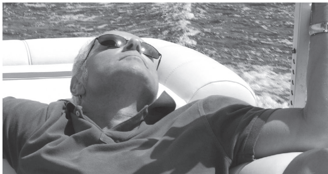
A wide array of sunglasses can protect eyes from potentially damaging ultraviolet radiation.