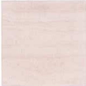
WBT01 ▶ Travertine White