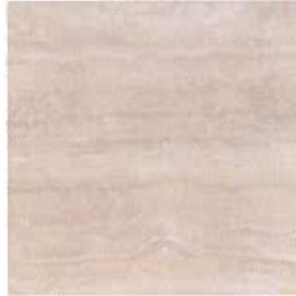
WBT04 ▶ Travertine Sand