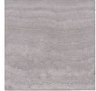
WBT06 ▶ Travertine Ash