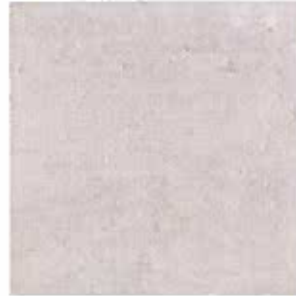
WBC05 ▶ Concrete Dove