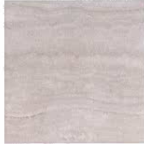
WBT05 ▶ Travertine Dove