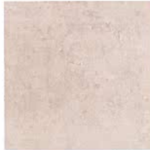
WBC04 ▶ Concrete Sand