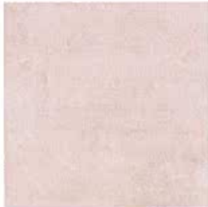
WBC01 ▶ Concrete White