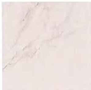
WBS01 ▶ Statuario