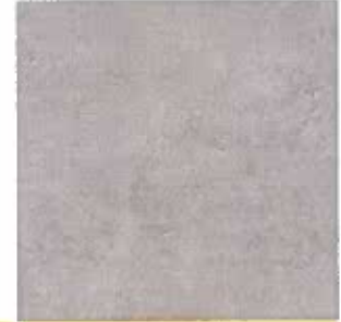
WBC06 ▶ Concrete Ash